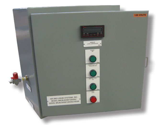
Bubbler Liquid Level Controller examples