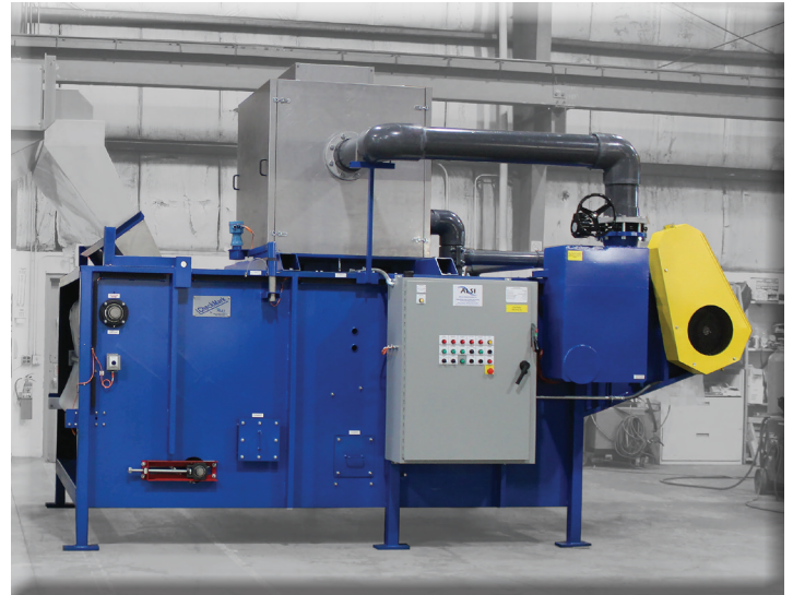
Single fan design (high volume, low temperature)

Optimize scrubber efficiency by capturing maximum solids in recirculation water thereby returning only clean water to paint booths. Dry sludge for recycling/disposal. Minimize paint booth downtime for cleaning.