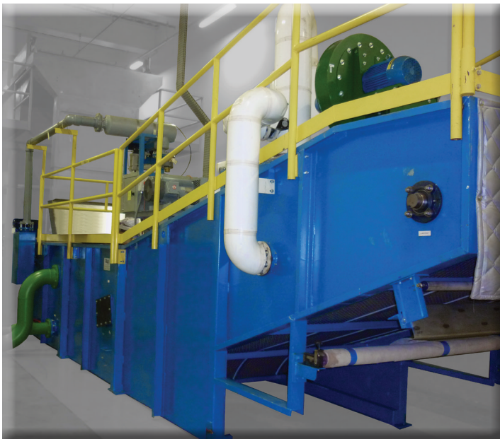
Dual fan design (high volume, high temperature)